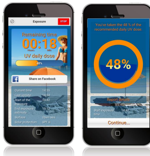
Screenshots of the HappySun App: real-time UV dosimeter function.

This technology has been developed by Flyby Srl (Italy) spending more than 5 years of research & development and validation activities made also in collaboration with the European Space Agency (ESA) and many public organizations bodies in the field of environmental health protection such as the Public Health England (PHE) .