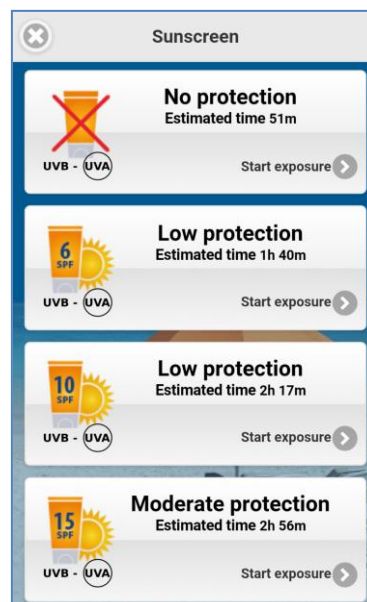
Screenshots of the HappySun App: sunscreen – safe exposure time recommendations function.

The HappySun App provides real-time personalized recommendations and useful information for a safe sun exposure: user phototype and Minimal Erythema Dose (MED) are calculated by an expert system based on an anamnestic questionnaire. Once both the user phototype and UV radiation have been determined for the exposure location, following the smartphone's geolocation , HappySun immediately calculates the personal safe-exposure time , taking into account also the SPF (Sun Protection Factor) of the sunscreen possibly applied and the ground-reflected radiation surrounding the user. Moreover the system is able to provide recommendations both on the sunscreen to be applied and on the sunglasses for eye protection depending on the real-time measured UV radiation .